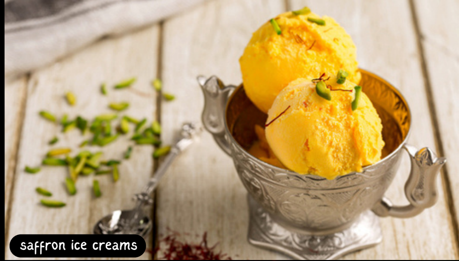
saffron ice creams